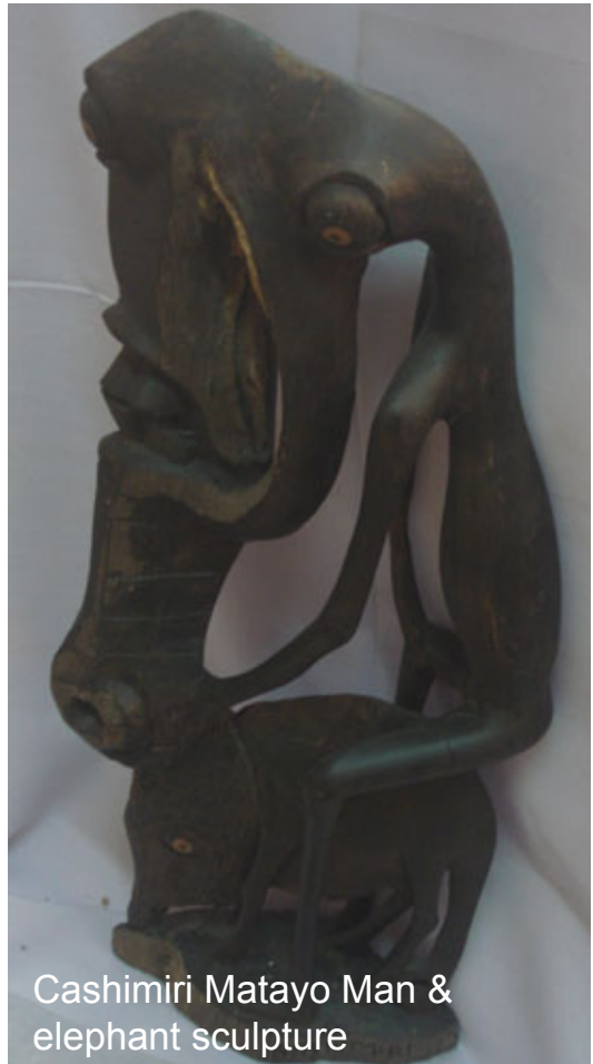
Cashimiri Matayo Man & elephant sculpture