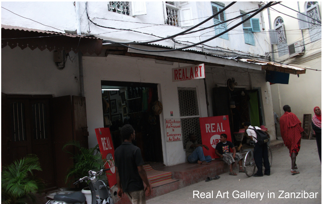
Real Art Gallery in Zanzibar